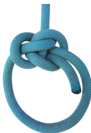
Anti Lees link Bowline