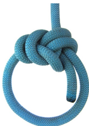
Anti EBSB Bowline