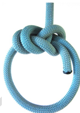
Anti Yosemite Bowline