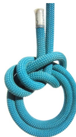
Anti Bowline on-a-bight