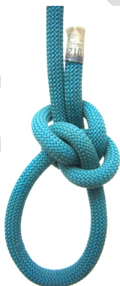
Lees link Bowline