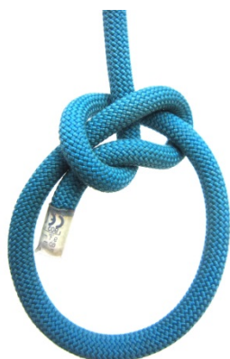
Anti #1010 Bowline