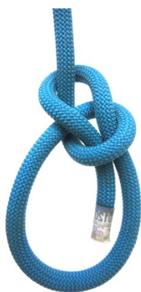
#1010 Simple Bowline