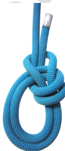
#1080 Bowline on-a-bight